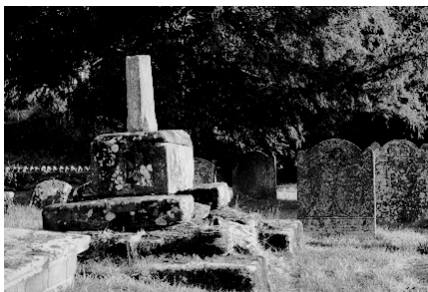
The 14th century preaching cross

The church was originally a chapel of the church at Lugwardine, then briefly annexed to the church at Hentland before finally becoming a parish church in its own right in 1862.